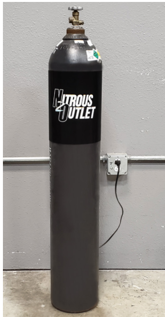
WITH PICK-UP TUBE

For best results on Mother Bottles that have a pick up tube the heater element will need to be installed at the top section of the bottle, right below the crown.